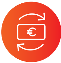
Regular cash flow

Our business loans are unrestricted by purpose, so whatever your clients need we can help.