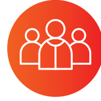
Increasing staff count