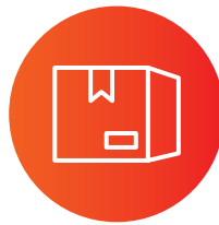
Purchase of stock