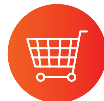
Purchase of equipment